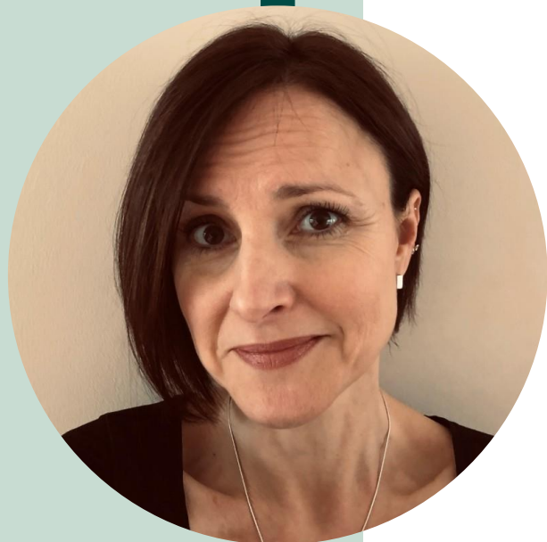
Professor of Occupational Psychology at Hult Ashridge Executive Education.

The 'new normal' hybrid environment presents significant challenges to our ability to feel included and establish a sense of belonging at work.