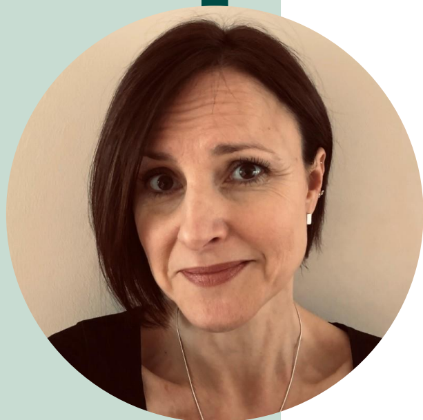
Professor of Occupational Psychology at Hult Ashridge Executive Education.

The 'new normal' hybrid environment presents significant challenges to our ability to feel included and establish a sense of belonging at work.