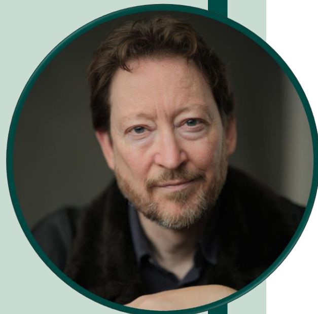
Theatre Director, Actor and educator